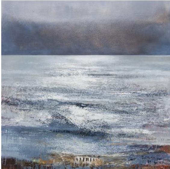
Kurt Jackson sea scape

Bring your two completed double pages to the first lesson. You may decide to stick any photos you took into your book too, possibly on the first page.