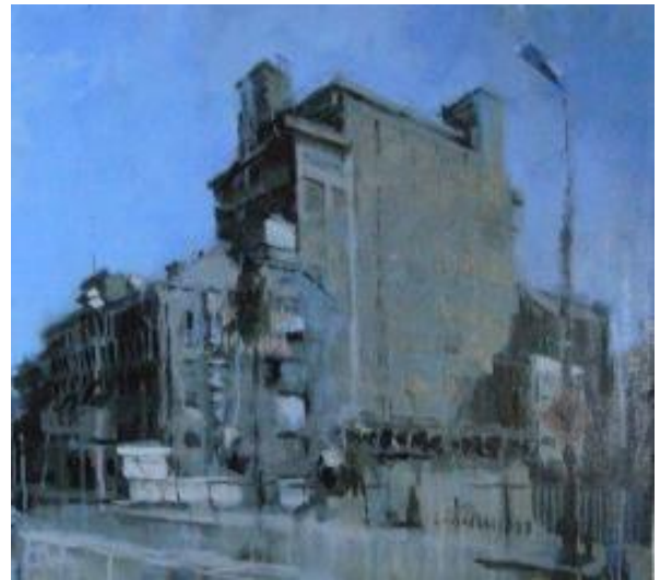
Cian McLoughlin landscape